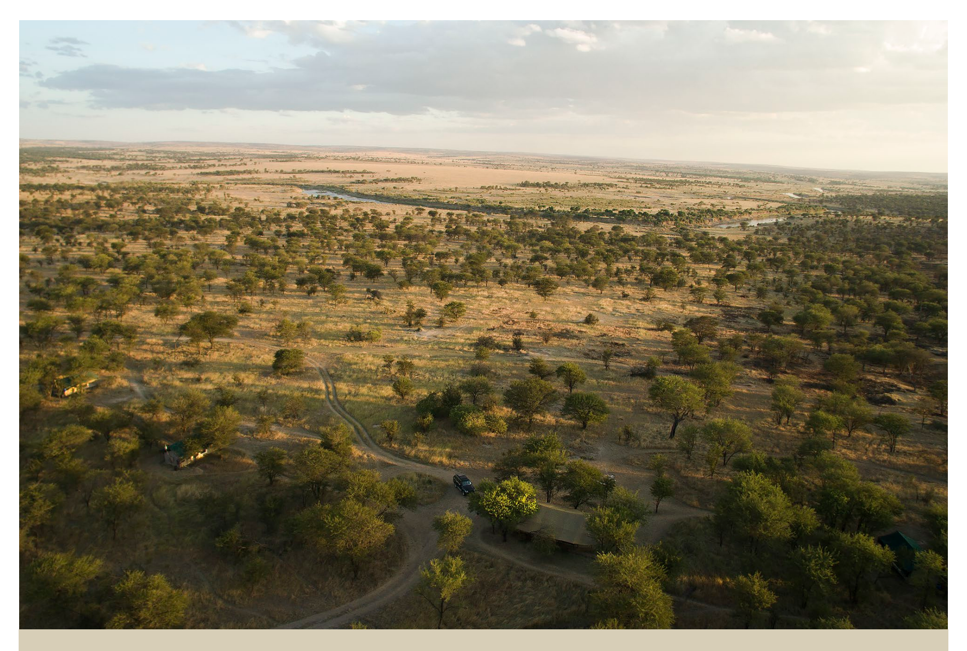
ALEX WALKER'S SERIAN